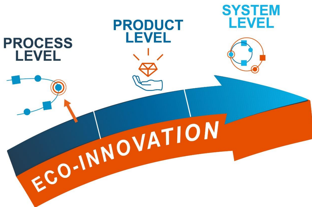
Figure 3. Three forms of eco-innovation.

As these three stages indicate, environmental value creation grows progressively with each eco-innovation step. Generally speaking, we cannot expect process and product eco-innovations alone to make the fundamental shift from the linear economy model to the circular economy model, which is required to address the current environmental crisis. Energy and resource efficiency, cleaner production processes, resource-saving products, etc., are necessary but insufficient strategies. Ultimately, a radical transformation is needed at the system level (involving relationships among the stakeholders in the value chain, infrastructures, consumption patterns, etc.) in order to ensure a shift in functionality or modality (e.g. mobility) from an unsustainable solution (e.g. car) to a sustainable option (e.g. bicycle) and to enable a shift to services that dematerialise as much as possible (e.g. telework).