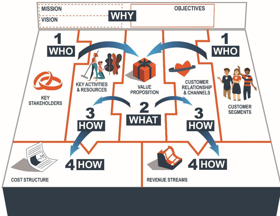
Figure 2. Business Model (adapted from Osterwalder and Pigneur, 2010).